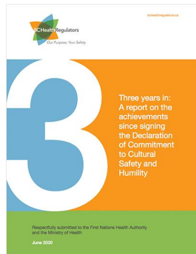
Three years in: A report on the achievements since signing the Declaration of Commitment to Cultural Safety and Humility (PDF)