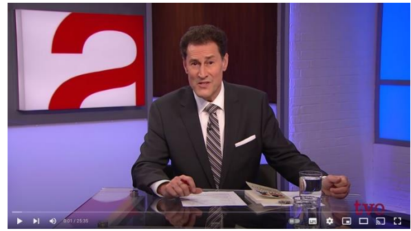
The Indian Act Explained (YouTube)