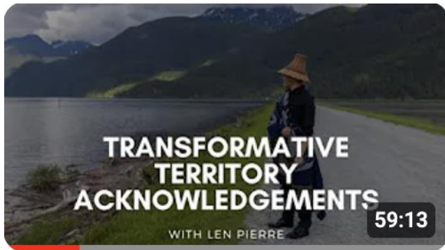
Transformative Territory Acknowledgements

A series of one-hour webinars on topics of interest. More topics are added regularly to the YouTube channel .