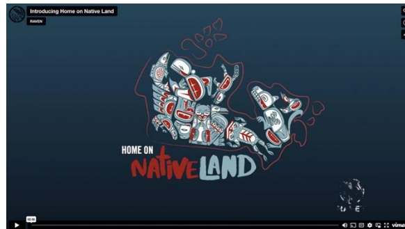
Home on Native Land: Indigenous Justice in Canada (10 Videos)