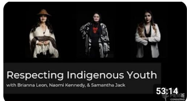
Respecting Indigenous Youth