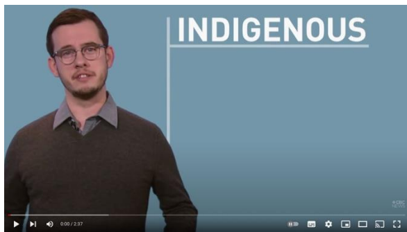
How to talk about Indigenous people (YouTube)